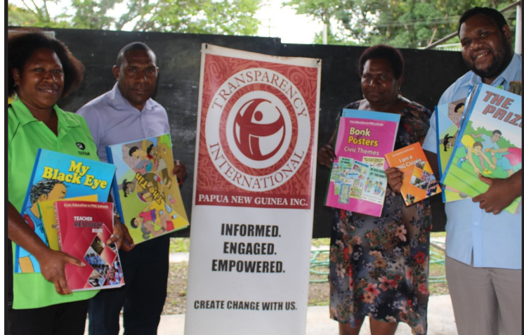
Oxfam, Goroka District Education Office and TIPNG representatives with a full set of TIPNG's Civic Education materials .

In February the Oxfam Governance Team and the Goroka District Education Office team visited our office to learn more about the Civic Education Materials developed by TIPNG.