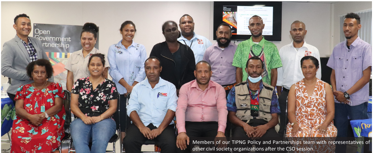
Members of our TIPNG Policy and Partnerships team with representatives of other civil society organizations after the CSO session.

In preparation for the National Open Government Partnership (OGP) National Action Plan (NAP) Co-creation workshop in September, we hosted a PNG OGP civil society organization (CSO) session this quarter, to enable greater and more informed participation by civil society stakeholders in the NAP 2 co-creation process.