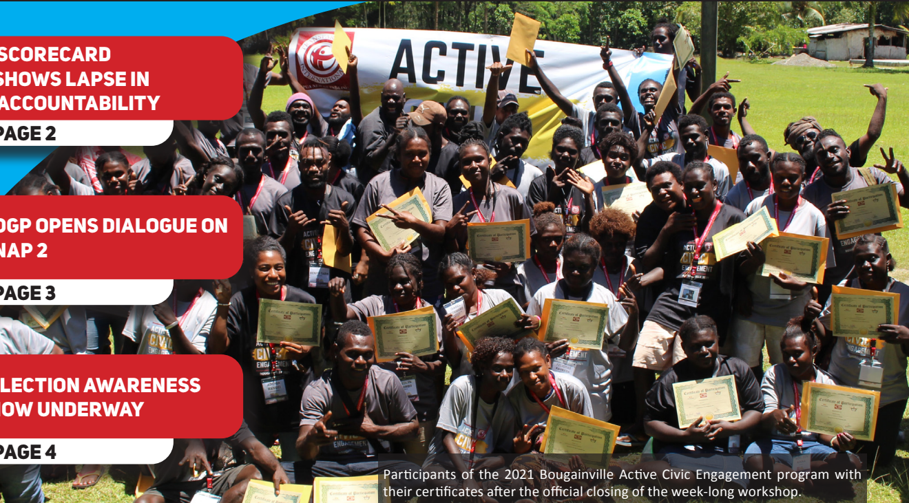
Participants of the 2021 Bougainville Active Civic Engagement program with their certificates after the official closing of the week-long workshop.