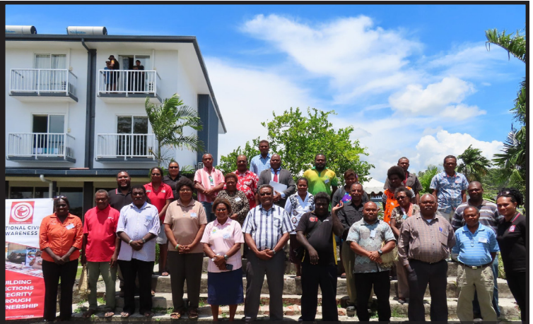
The TIPNG BEIP outreach team with representatives from over 15 key stakeholder organizations in East New Britain. On the historical Queen Emma Forsayeth steps in Kokopo, during the stakeholder workshop component of our recent provincial outreach to East New Britain.

However due to recent surge in covid 19 cases through the country, provincial outreach has been deferred until the health situation is deemed is safe to travel again.