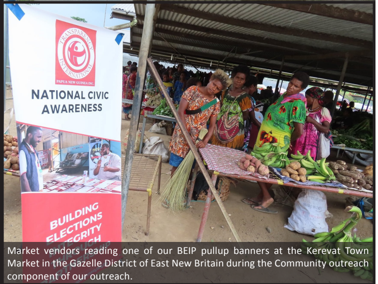
Market vendors reading one of our BEIP pullup banners at the Kerevat Town Market in the Gazelle District of East New Britain during the Community outreach component of our outreach.