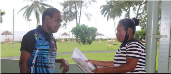
TIPNG Observers in Alotau going through voter survey questionnaire.