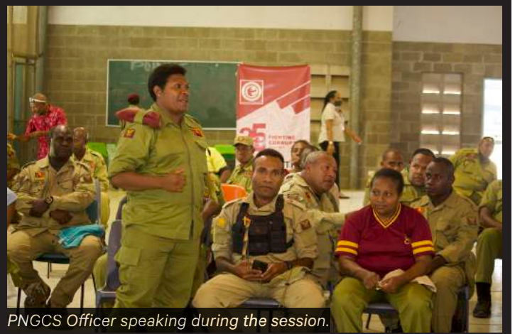
PNGCS Officer speaking during the session.

During the sessions, we presented ethical dilemmas to each group for participants to analyse what they would do if faced with such a dilemma. Discussions were held about corruption in the elections and how security forces can uphold integrity during elections and ensure a free, fair, and safe election in PNG.