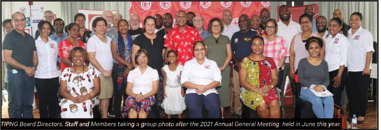
TIPNG Board Directors, Staff and Members taking a group photo after the 2021 Annual General Meeting held in June this year.

We held our Annual General Meeting (AGM) on Saturday 25th June 2022 in Port Moresby. In compliance with the Associations Incorporation Act 1966, at the AGM we presented to our members the 2021 Annual Report containing a further successful, unqualified audit report, on its accounts for 2021.