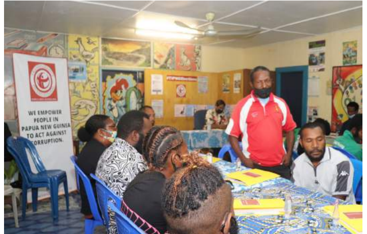
TIPNG Observer introducing himself during the Morobe Observation Training.