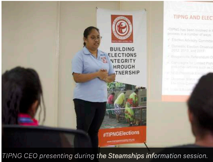
TIPNG CEO presenting during the Steamships information session.

In May, we were invited by our Corporate Member, Steamships Trading, to facilitate an information session on voter rights and responsibilities.