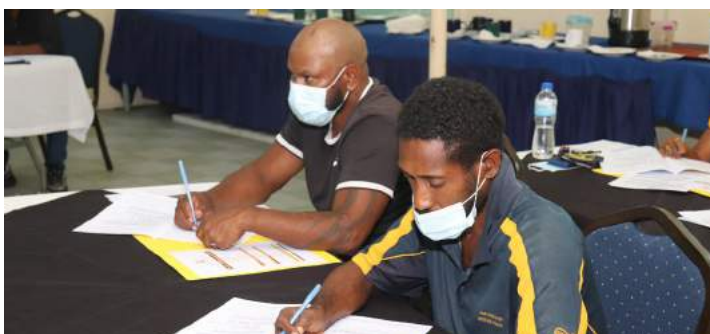
TIPNG observers during the Oro Province Observation Training.

We will release our 2022 Election Observation Report in the 4th quarter of 2022 and will be working alongside other domestic & international observers and state agencies, such as the National Research Institute, on post-election analysis to further inform reforms for electoral integrity in Papua New Guinea.