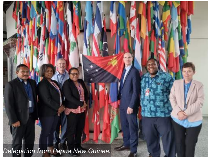
Delegation from Papua New Guinea.

This participation by TIPNG continues the collaboration between state agencies and non-state actors to implement PNG's obligations under the UNCAC, through the National Anti-Corruption Strategy 2010-2030. In 2021 TIPNG completed a CSO report on PNG's implementation of Chapter 2 & Chapter 5, which was presented to the Government and subsequently shared with the UNODC in May 2022 when PNG underwent a peer review.