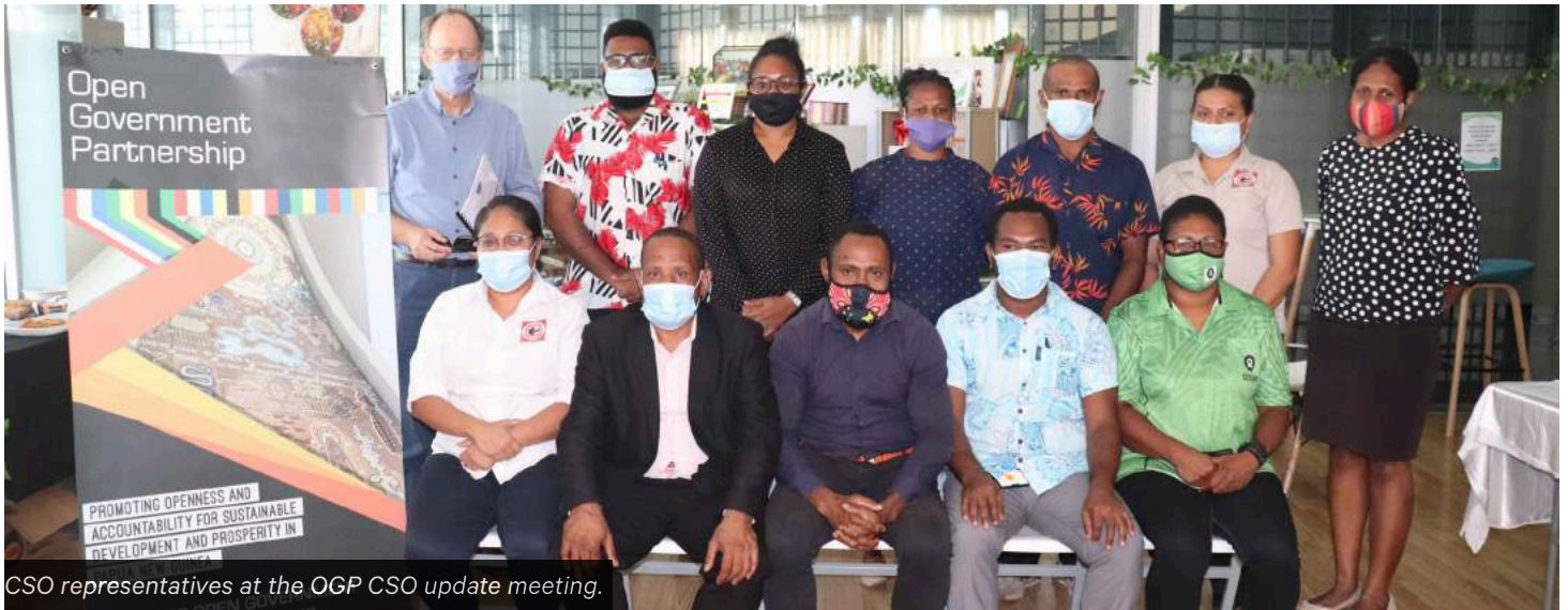
CSO representatives at the OGP CSO update meeting.

As Co-Chair of PNG Open Government Partnership (OGP), we hosted a Civil Society Organization (CSO) meeting with partner NGOs. The meeting had representatives from: Caritas PNG, Centre for Environmental Law and Community Rights (CELCOR), Consultative Implementation and Monitoring Council (CIMC), Equal Playing Field, Institute of National Affairs, Oxfam PNG, PNG Resource Governance Coalition, and The Voice Inc. The Department of National Planning & Monitoring was also present at the meeting as the Chair of the PNG OGP.