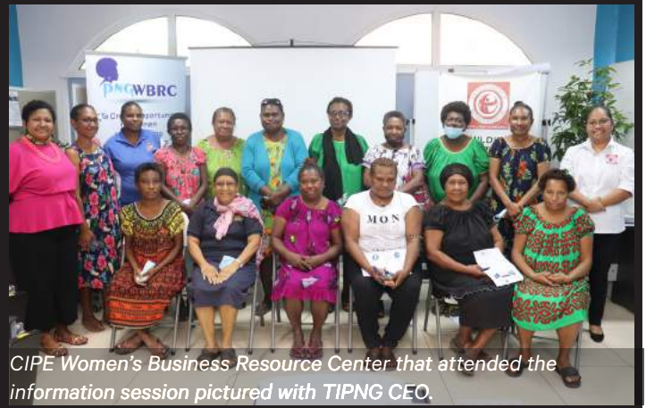
CIPE Women's Business Resource Center that attended the information session pictured with TIPNG CEO.

We thank the CIPE for the invite and we look forward to working with them again in the future.