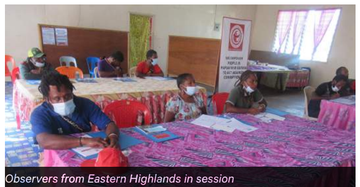
Observers from Eastern Highlands in session