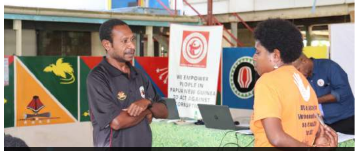
TIPNG Observers in Daru practising the voter survey interview.