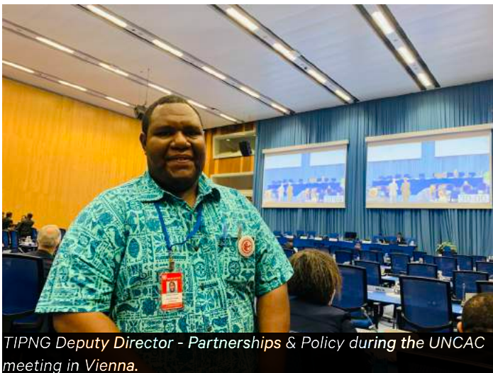
TIPNG Deputy Director - Partnerships & Policy during the UNCAC meeting in Vienna.

Enroute to the IRG Meeting the PNG Delegation also had the opportunity to meet with key anti-corruption agencies in the Philippines to learn and share experiences on areas of mutual interest.