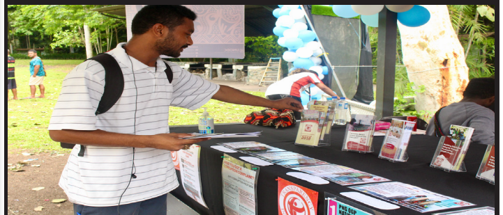
A visitor looking at information at the TIPNG booth during the International Day for Universal Access to Information Day organized by UNODC.

The event at Nature Park saw students sharing information and insights on the impact of corruption and the extent of access to information. Other organizations that participated at the event were the Interim ICAC Office, the National Judicial Staff Services and the UN Office of the Human Rights Commissioner.