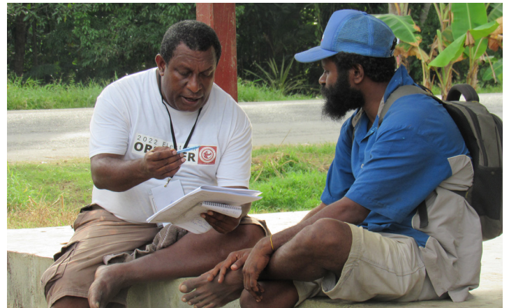
Madang Observer engaged in a interview with voter.