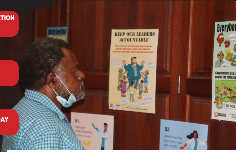
A TIPNG workshop participant in Eastern Highlands Province looking at information posters.