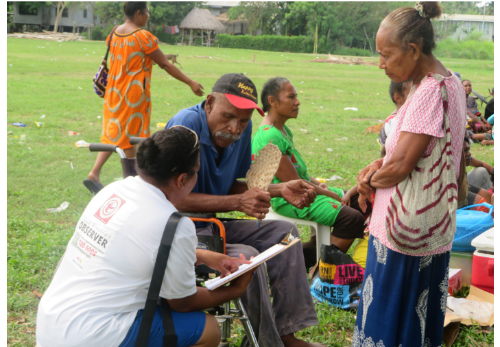
TIPNG Observer conducting voter survey in Central Province.

We are now in the process of compiling the reports from our 300 observers across 20 provinces. You can access our Summary Paper here: https://transparencypng.org/pg/wp-content/uploads/2022/08/TIPNG-2022-Election-Summary-Paper_August-2022.p