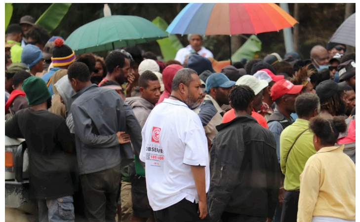
TIPNG volunteer observing elections in Simbu.