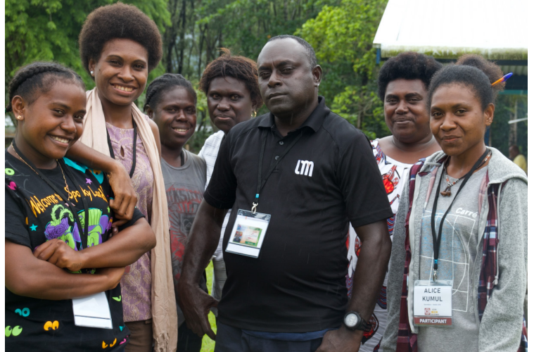
Participants of the Bougainville ACE workshop.

Bougainville Partnership, TIPNG and the Autonomous Bougainville Government's Community Development Department have been collaborating to strengthen and