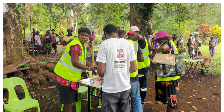
TIPNG Observer speaking to the polling officials in New Ireland Province.