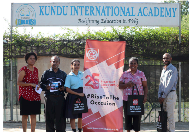
Deputy Director Communications handing information packs to Kundu International Teachers and student leader of the week.