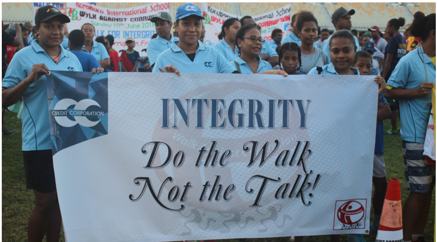
Credit Corporation (PNG) Ltd staff taking part in the 2018 Sir Anthony Siaguru Walk Against Corruption.