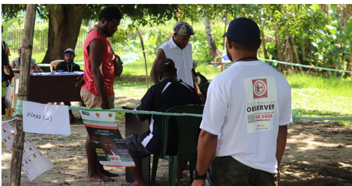
TIPNG Observer watching the roll check in West Sepik Province.