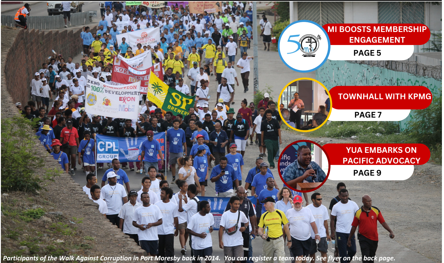
Participants of the Walk Against Corruption in Port Moresby back in 2014. You can register a team today. See flyer on the back page.