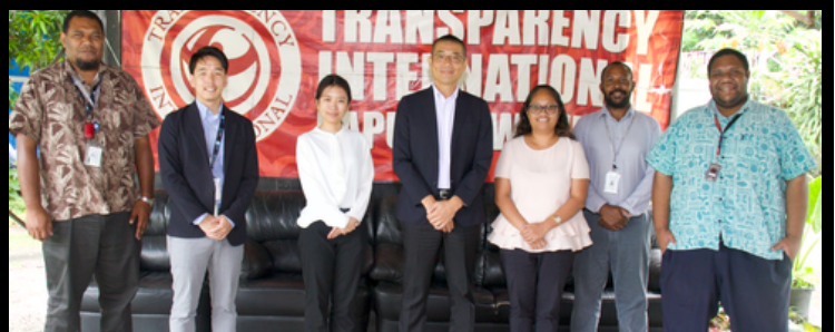
The JICA team pose for a photograph after their meeting with TIPNG's CEO and Deputy Director - Partnerships & Policy.

In February we also met with regional experts from the International Institute for Democracy and Electoral Assistance (IDEA), an intergovernmental organization that works to support and strengthen democratic institutions and processes around the world.