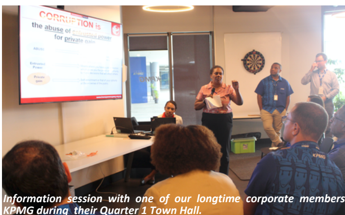
Information session with one of our longtime corporate members KPMG during their Quarter 1 Town Hall.

We were invited by KPMG to present on our work at their townhall session. During the session we highlighted our work and mission in empowering people to combat corruption in the country.