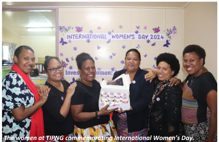
The women at TIPNG commemorating International Women’s Day.

In commemorating International Women’s Day, our male colleagues took the lead in celebrating and appreciating the work and contribution of their female colleagues in the workplace.