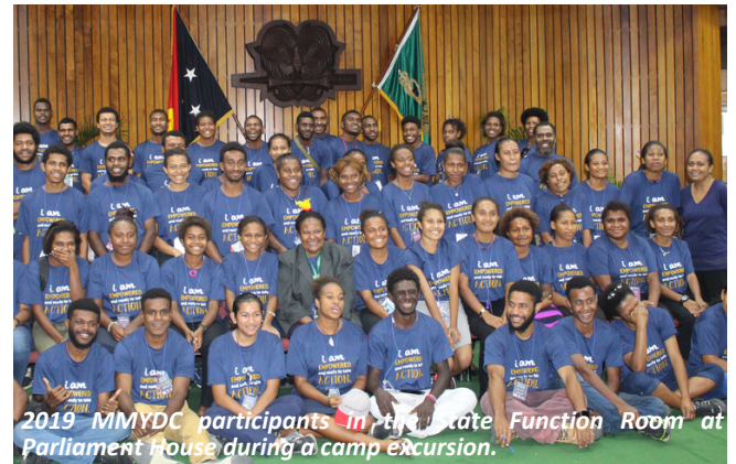
2019 MMYDC participants in Parliament House during a camp excursion.

Following the riots of January 10 this year, the Mike Manning Youth Democracy Camp scheduled for the end of January was deferred. The Camp is now set to happen from 25th June to 4th July 2024. Fifty (50) young people from across the country will come into Port Moresby to attend the intensive democracy camp to learn about principles of a democracy, elections, how laws are made, challenges on governance and leadership.