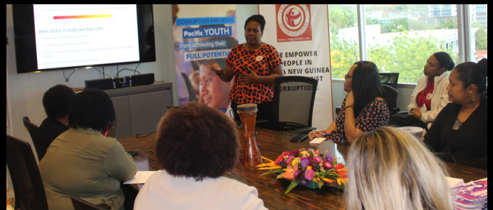
ICAC Staff listening to TIPNG Deputy Director Communications present on the 2023 CPI results.

The ICAC office invited us to share more insights on the 2023 CPI score and discuss ways forward that integrity institutions in Papua New Guinea can work together to see meaningful change.