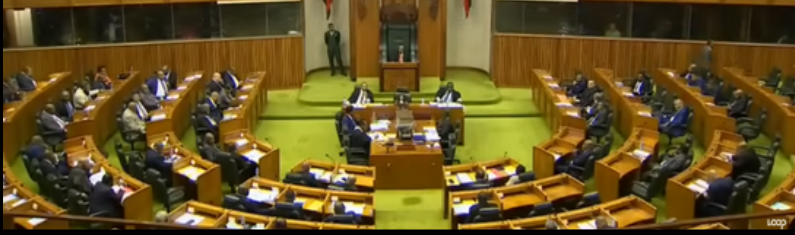
Parliament sitting on February 15 during the vote of confidence

The recent political tussle over the Vote of No Confidence motion in February raised questions and doubt on the democratic processes of the country.